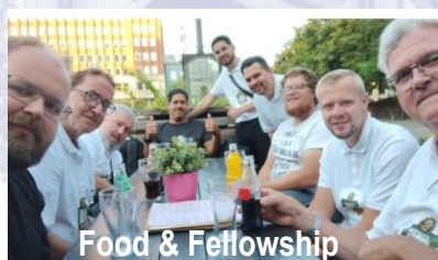
Food & Fellowship

gospel tracts. I believe we gave out over 6 thousand Chick tracts in five days. There were 118 people who prayed to accept Jesus Christ as their Saviour. It