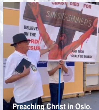
Preaching Christ in Oslo.

was amazing! I preached several times every day. By the time I