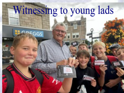
Witnessing to young lads