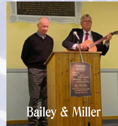
Bailey & Miller

The Footdee or the ‘Fittie’ Church, as the locals call it, is over 200 years old. I’ve preached at the church for over 30 years. There have been souls saved there over the years.