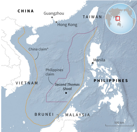
*Extent based on China's "Nine-dash line"

Threats of arrest are now being announced against Filipinos fishing in their own native waters. The Philippine government has said that if these sorts of actions result in the death of a Filipino citizen, that the Republic of the Philippines may take it as an act of war. The USA has heavily increased its military presence here on and around Palawan, and would presumably come to the aid of the Philippines should hostilities grow worse.