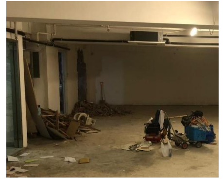
Before and after pictures of church