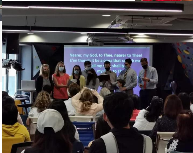
Services in temporary venue