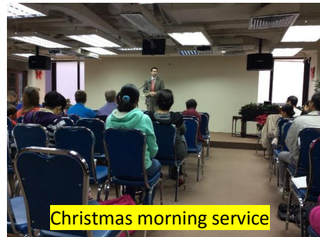
Christmas morning service