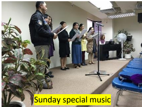
Sunday special music