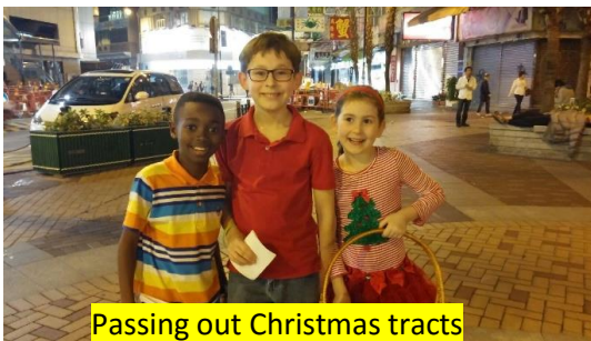
Passing out Christmas tracts